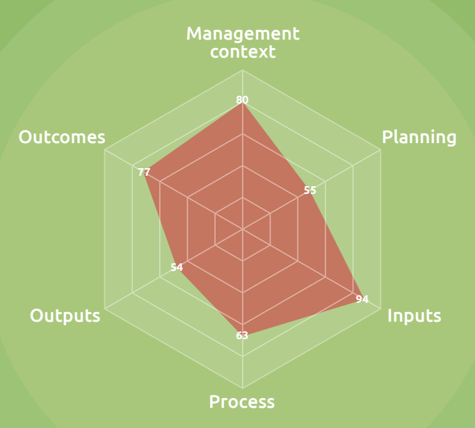
Graphic 2. Visualization of results: management effectiveness evaluation of a protected area